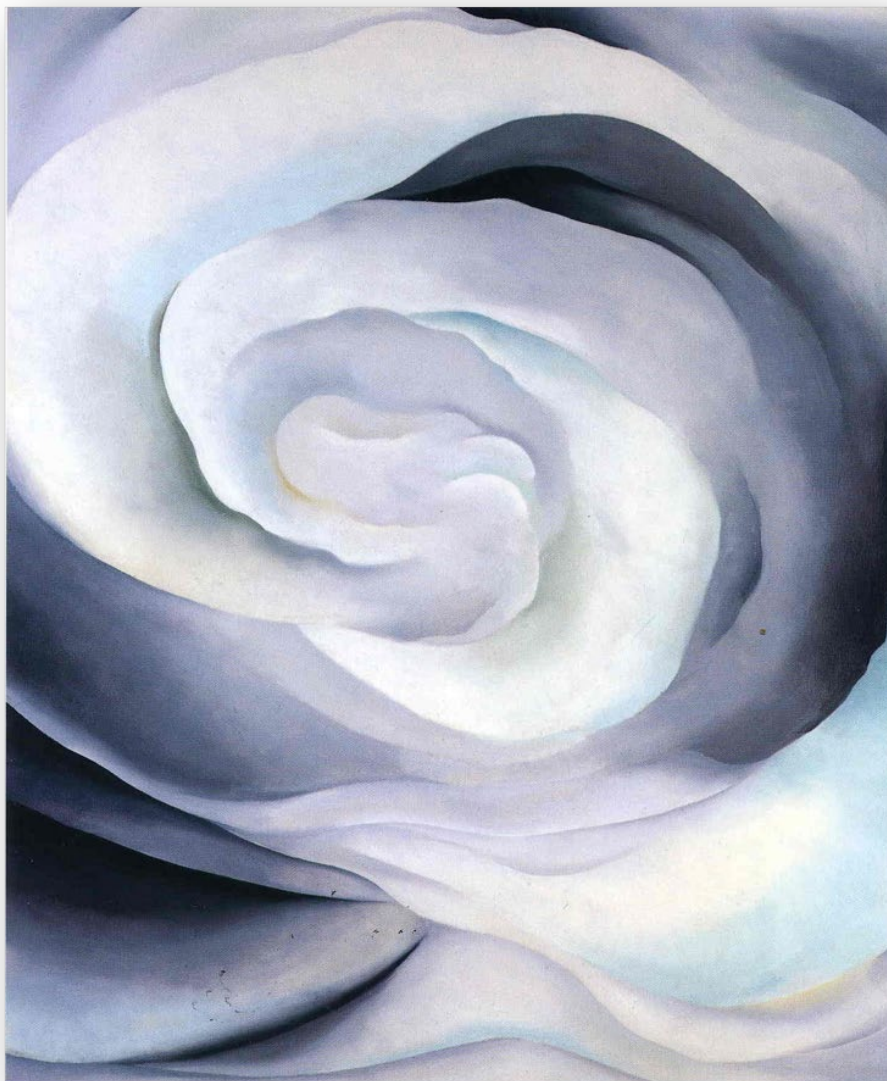
Abstraction White Rose by Georgia O'Keefe