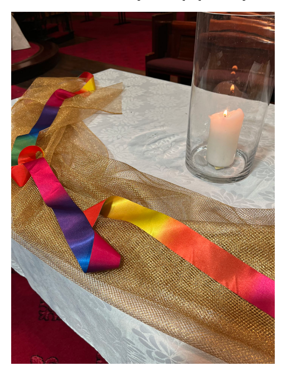
Proudly supporting Sydney Mardi Gras 2025