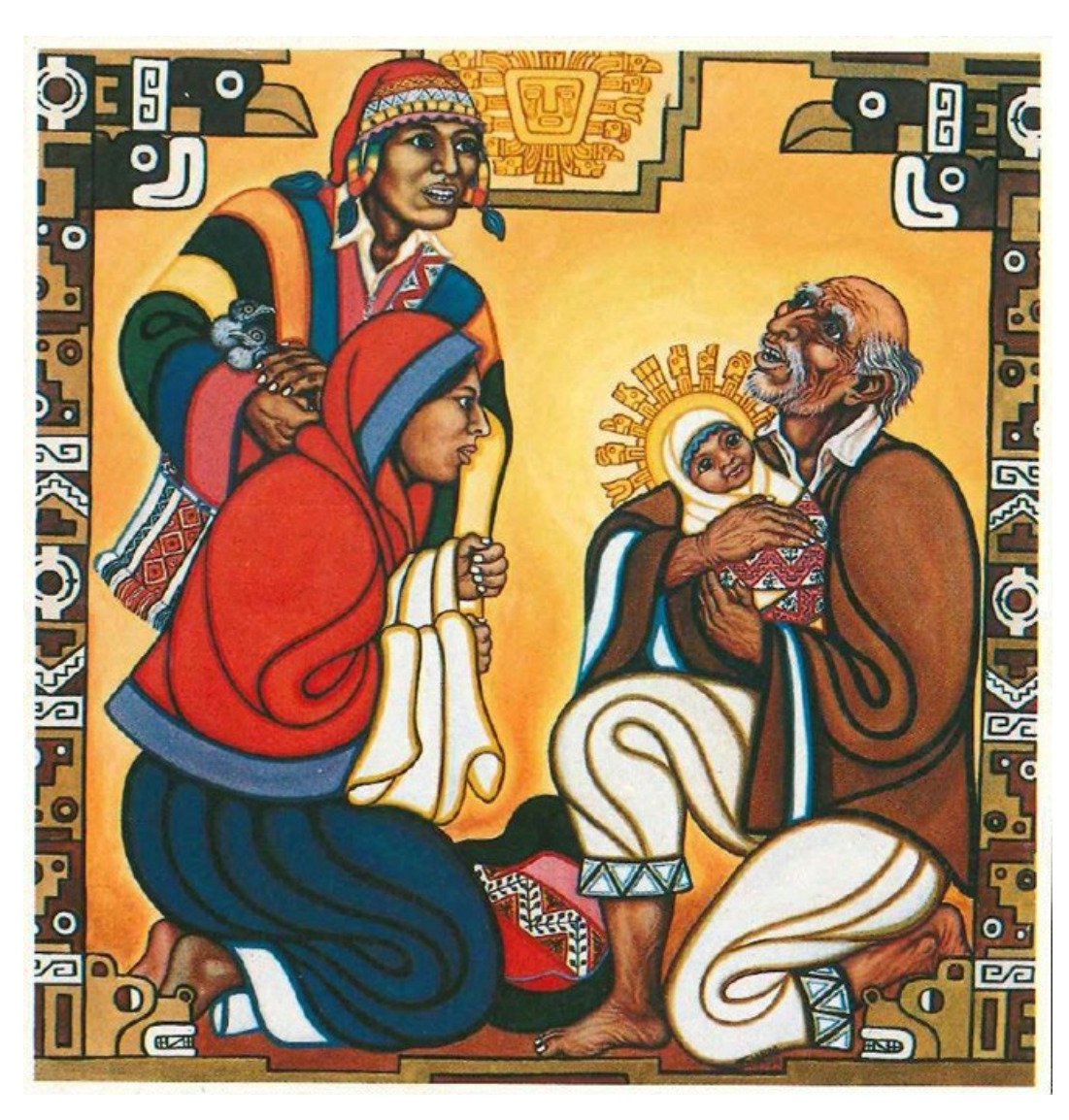
Image: Simeon Blessing the Christ Child by Severiano Blanco