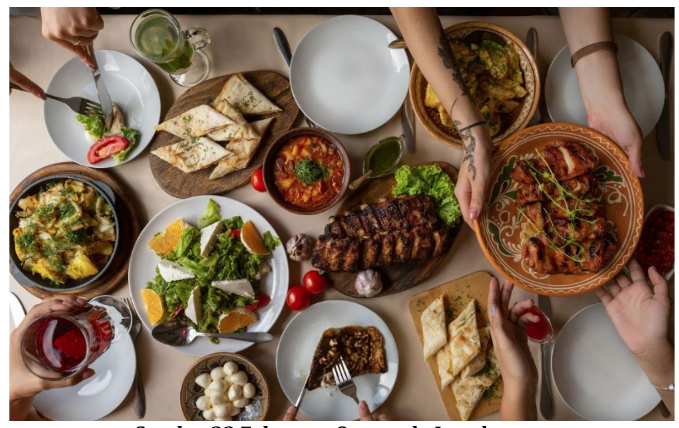
Sunday 23 February Quarterly Luncheon 11.30am - after Worship

Bring a plate and enjoy a time of fellowship at our first Quarterly Luncheon for 2025.