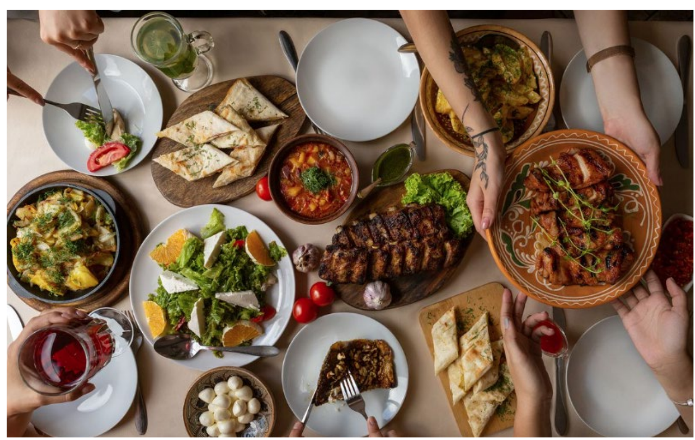
Sunday 23 February Quarterly Luncheon 11.30am - after Worship

CCLI Licenses: Streaming 17918 Reproduction: 557214 Video: 128166