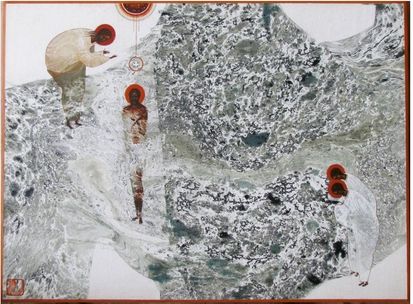
Ivanka Demchuk (Ukrainian, 1990–), Baptism of Christ , 2015. Mixed media, canvas & wood.