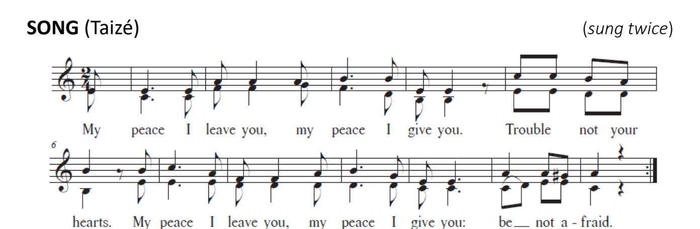
My peace I leave you, my peace I give you: trouble not your hearts. My peace I leave you, my peace I give you: be not afraid.