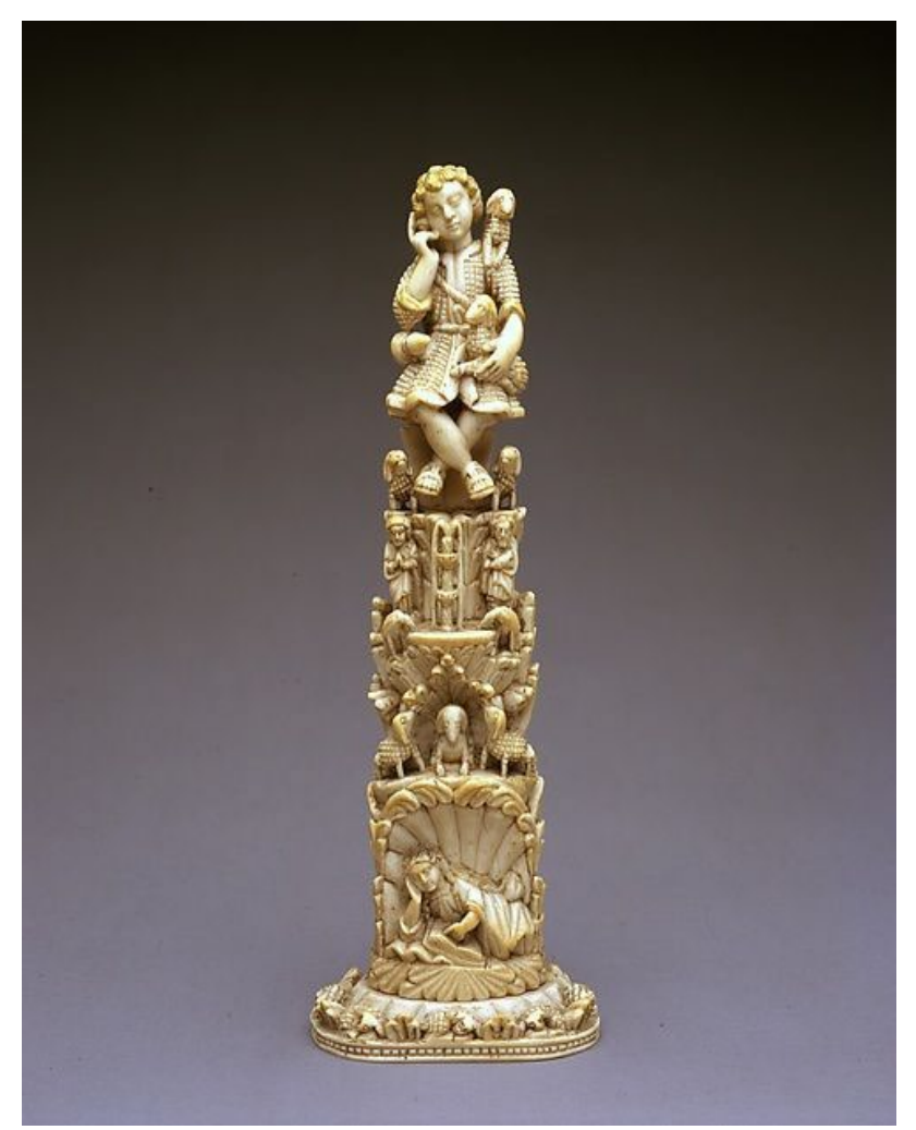
Image: Christ Child as the Bom Pastor (Good Shepherd) Carved Ivory, Goa culture, India circa 1700